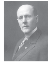
Paul Harris, Founder of Rotary