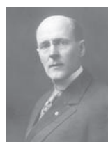
Paul Harris Founder of Rotary